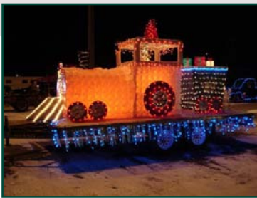
Coaldale Bottle Depot's Christmas parade entry.

This float was the 2007 entry by the Coaldale Bottle Depot in the Christmas Parade. The depot enters every year and this year's entry required immense creativity!