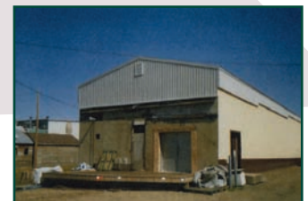
AFTER: The new dock and dock doors at rear of building - metal sheathing yet to be put on.