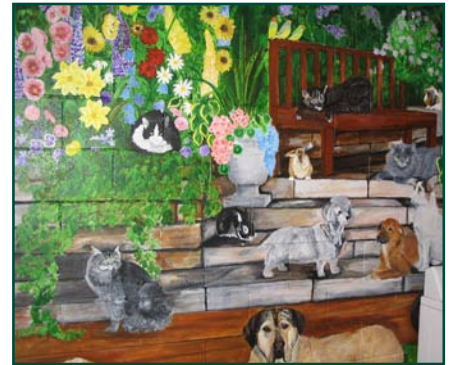
Mural painted by a local artist enhances S.P.C.A. facility.