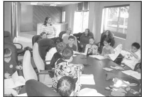
Students from Annie Foote School participate enthusiastically in on-site classroom activities at ABCRC

One of a number of school programs offered through the City of Calgary is City Hall School. These programs are an opportunity for teachers of students in grades 3 to 12 to spend a week in classes away from the school venue. They are intended to compliment school curriculum and by customizing the focus for the week, plenty of time is scheduled for discussion, journal writing and sketching as teachers and students work with planners, policemen, social workers, historians and aldermen to learn what it means to be a Calgarian!